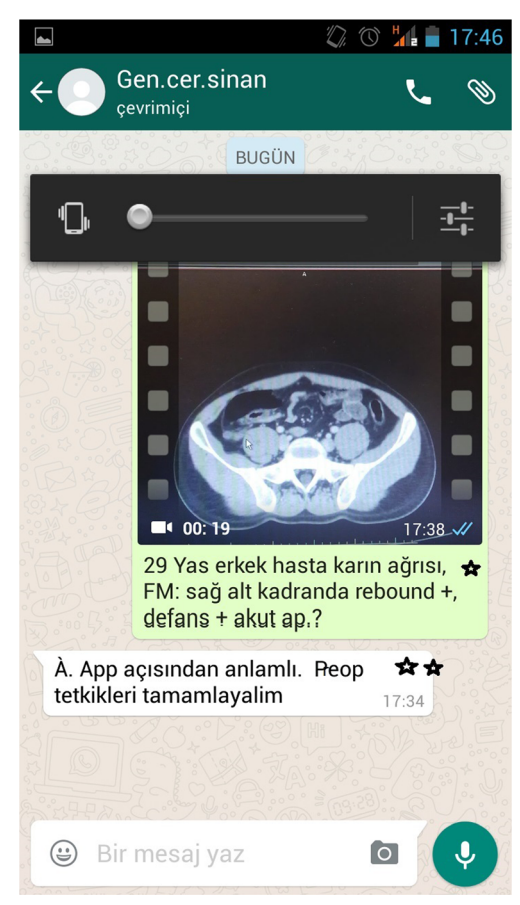
Fig. 1 WhatsApp screenshots showing communication between an emergency physician and a consultant. Because physicians' main language is Turkish, all communications is Turkish. Meanings in English are showed in figure legends. (Meaning in English)- Message sent to general surgeon S.H., *29-year-old male patient with acute abdominal pain, patient history; congestive heart failure, hypertension and chronic pulmonary disease, physical examination (PE); rebound tenderness and rigidity on right upper quadrant. ** "Evidence of appendicitis on computerized tomography, make preoperative preparation

The median arrival time of data to consultant was 3.94 min (min-max: 1–34 min). The median response time of the consultant to WhatsApp messages containing preliminary diagnoses, laboratory test results and radiographic images was 2.83 min (min-max: 1–29 min). Regarding consultation